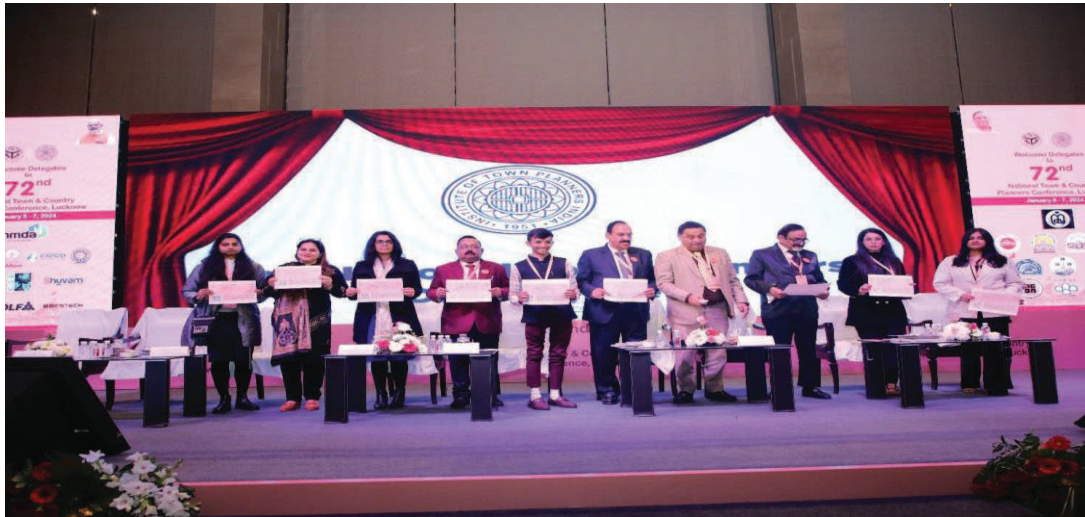
A special session with Young Planners at the 72nd National Town and Country