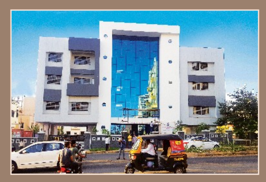
Pune Center, Maharashtra Regional Chapter