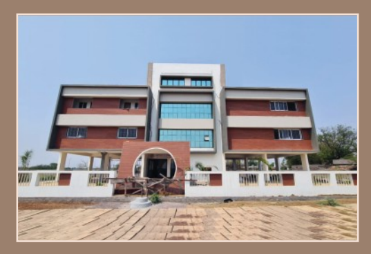
Chhattisgarh Regional Chapter, Raipur