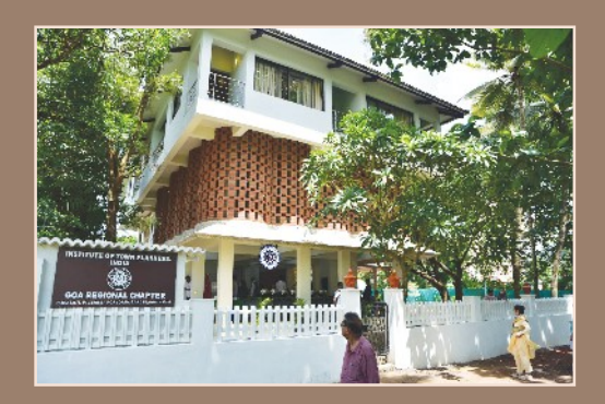
Goa Regional Chapter, Panaji