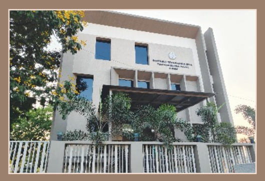
Tamil Nadu Regional Chapter, Chennai