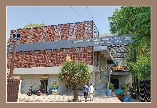
Madhya Pradesh Regional Chapter, Bhopal